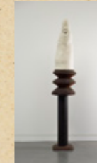
Brett Whiteley Shark (male) 1966, fibreglass, plaster, copper, maplewood, Brett Whiteley Studio