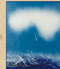
Brett Whiteley Coincidence 1973, oil on hardboard, Gift of Patrick White 1983, Art Gallery of New South Wales