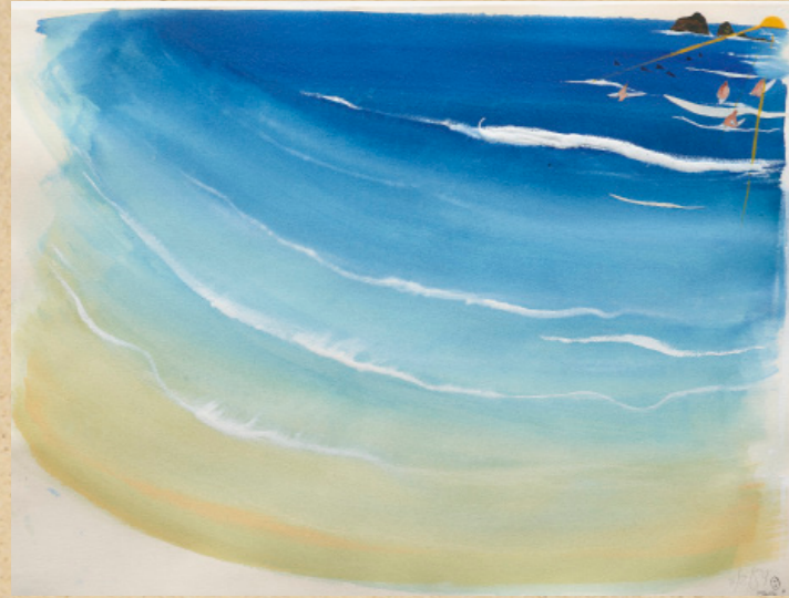
Brett Whiteley, Wategoes Beach II , 1989, watercolour, gouache, collage on white wove paper, Brett Whiteley Studio