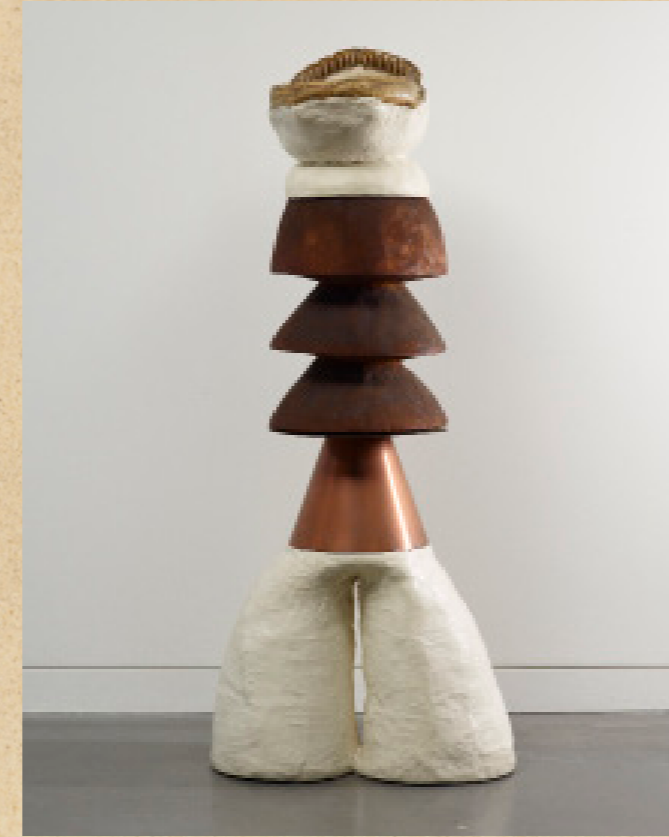
Brett Whiteley Shark (female) 1965, fibreglass, plaster, maplewood, chrome, copper, shark teeth, Brett Whiteley Studio

Find this sculpture titled Shark female . Walk around the sculpture and point out features that remind you of a real shark. Remember NO TOUCHING, she may bite!