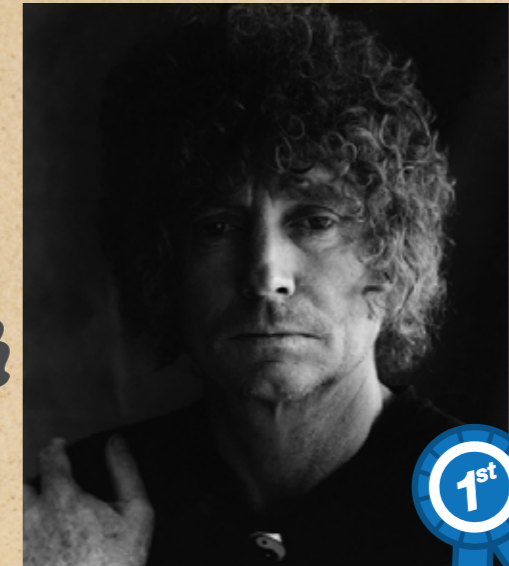
Brett Whiteley 1991.

Brett Whiteley was only seven years old when he won his first art prize! Later in life he went on to win many more including the Archibald, Sulman and Wynne art prizes.