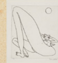
Brett Whiteley A day at Bondi (one of a suite of 10 etchings) from the suite A day at Bondi 1984, etching, black Charbonelle ink on ivory Arches wove paper, Brett Whiteley Studio