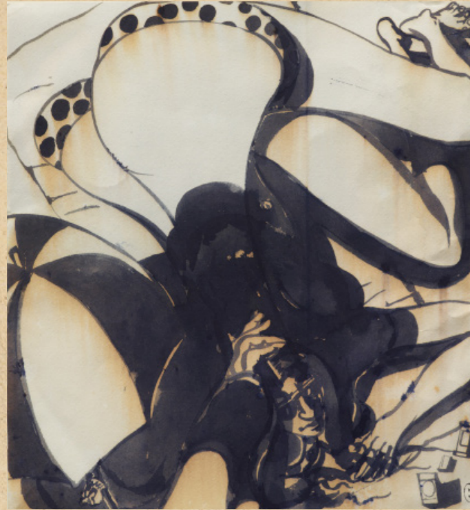
Brett Whiteley Bondi sunbather with sunglasses , brush and brown ink on white wove paper, Art Gallery of New South Wales, Brett Whiteley Studio