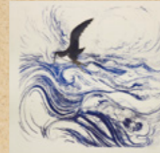
Brett Whiteley Gull over ocean 1973, brush and black ink, blue ball-point pen, collage, lithograph on cream laid paper, Brett Whiteley Studio

Write the correct art making medium on the dotted line below each image.