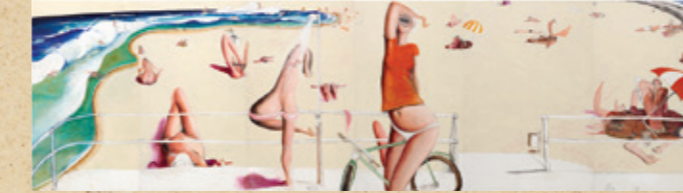
Brett Whiteley Unfinished beach polyptych , pencil, charcoal, blue fibre-tipped pen, collage on six plywood panels, Brett Whiteley Estate

Imagine that you have just arrived at this beach for a day of fun in the sun. What are you feeling?